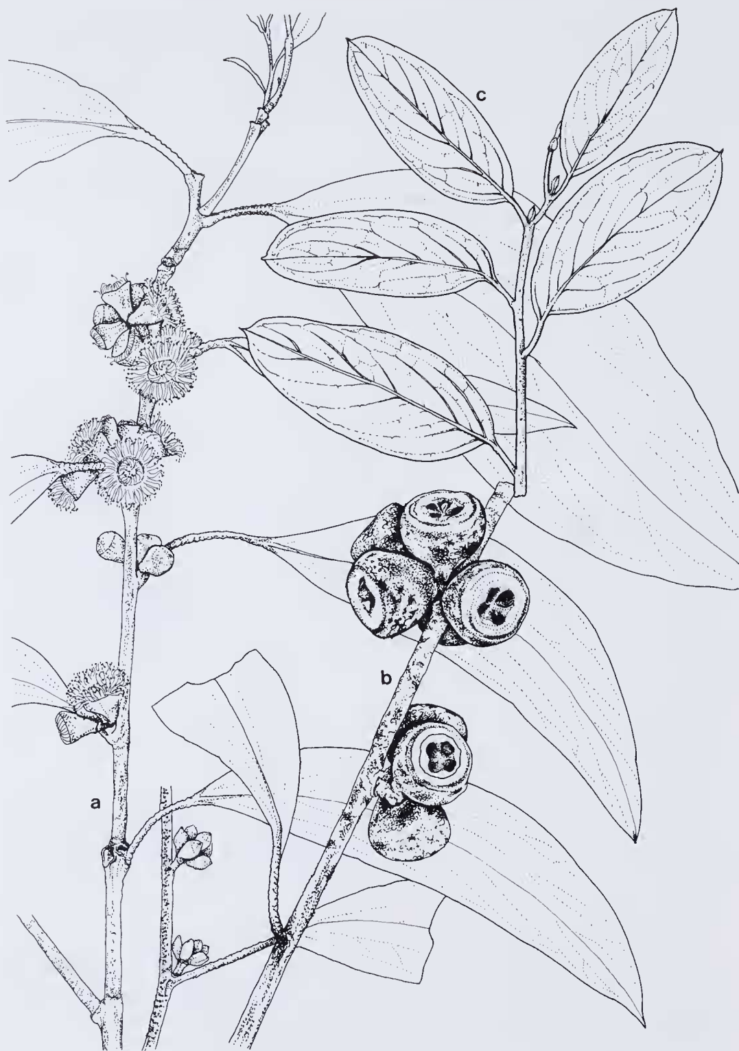
Fig. 3. Eucalyptus pauciflora ssp. hedraia . a — flowering branchlet \times 1 . b — fruits \times 1 . c — seedling leaves \times 1 .